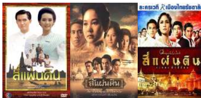
Fig. 1. Drama and Play of “Four Reigns” ( Si Phaen Din )

Furthermore, the novel is one of the escapist literatures which many Thai readers find it was the way to relax and go back to the peaceful time. The readers can learn lives of royal families and high classes from the novel through Mae Ploy, the main actress, since she was an officer in the royal palace and works for princess duties. (Figure 2) In addition, Mae Ploy was also in high class since her birth in the noble family and also married with the noble husband, an heir of Chinese-Thai rich person. Mae Ploy also transferred her high class to her children, Un and Odd, who studied abroad in the elite universities as Sorbonne University and Oxford University, respectively.