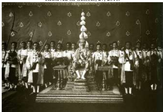
Fig. 9. King Rama 7 sat in the coronation ceremony around with his nobles.