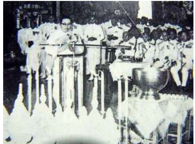
Fig 7. Brahmin is cursing and making a holy water in the oath of allegiance ritual

Oath of allegiance ritual is a ritual used when accepting the new royal officers to work for the king. The ritual is done by Brahmins who make the holy water in the big bowl keeping weapons such as swords, knives and spears. The Brahmins pray and give the curses that the disloyal royal officers who betray the king will die from the weapons in the bowl after they drink this holy water. In addition, the new royal officers have to give an oath and swear that they will not betray the king by any reason before drinking the holy water. Otherwise, they will get injured and die because of the weapons. The objective of this ritual is to threaten the new royal officers to be feared of the danger from betrayal and also to show that they will be loyal and obey the king. (Figure 7) The ritual appeared on the novel as stated by Mae Ploy's husband, Prem, who is the high ranked royal officer mentioned about the new royal officers, who did not care of the ritual, fight to abolish absolute monarchy in King Rama 7 reign and create the democracy to Thailand (at the time, it was called 'Siam'). This included Un, Mae Ploy's son, the political revolutionist and new royal officer who graduated from France and does not care of the traditional ritual.