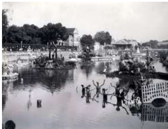
Fig 10. Loy Kratong at Bang Pa-In Royal Palace in the King Rama 5 Period

Loi Kratong Ceremony is the Brahmanism ritual for everyone who consumes water and may not intentionally damage water in the river. The ritual allows men to ask for apology for the god of river (in Brahmanism, there is a female river god named Ganges) by giving the floating flower, decorated with candle and incenses. The ritual is also for entertainment and it can be celebrated with fireworks. The ritual is stated in the novel when Mae Ploy followed her princess to Bang Pa-In Royal Palace, Ayutthaya to join the ritual with King Rama 5. (Figure 10 and Figure 11) Today, the ritual is a festival for entertainment and tourism, rather than the religiously related ceremony.