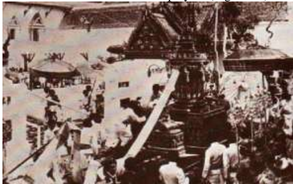
Fig 12. The urn of King Rama brought to royal cremation at the royal field near the grand palace (Sanam Luang or Thung Phra Men)

to heaven and finally the king were cremated. During the ritual, there can be Thai traditional music played. (Figure 12)