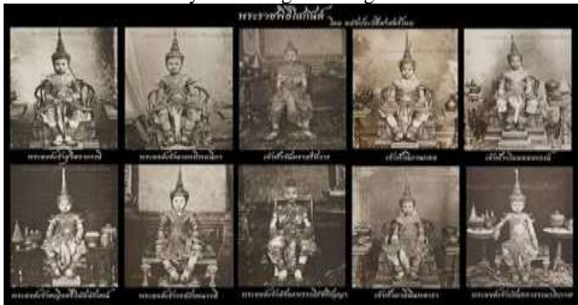
Fig 5. Princes and Princesses in King Rama 5 reigns (Children of King Rama5) who attended top knot-cutting ceremony