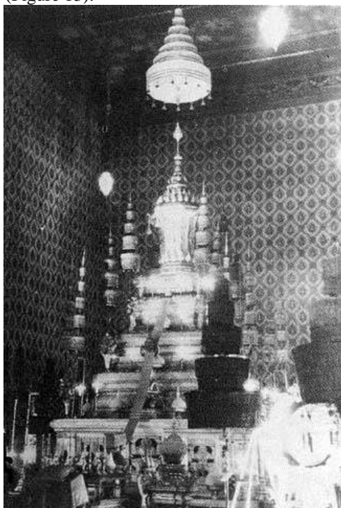
Fig 13. The Golden Urn of King Rama 8, which was not appeared on the Novel since Mae Ploy died of heart attack on the Day King Rama 8 passed away.

In the novel, the funeral of King Rama 5 is the biggest since he was the great king who has adorable achievements to Thailand (at that time called ‘Siam’), such as modernization and building infrastructure, fighting against colonization of Britain and France and bloodless abolishment of slavery. Therefore, he was greatly respected. In the novel, it did not mention about the cremation of King Rama 7 since the King died in UK and also King Rama 8 since Mae Ploy died of heart attack after the death of King Rama 8. Therefore, she could not go the funeral of King Rama 8. (Figure 13).