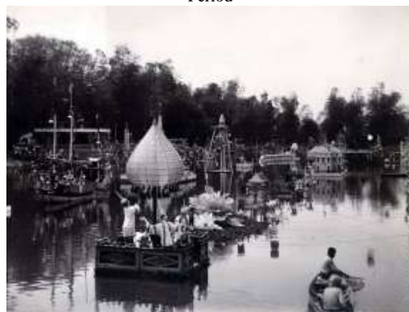
Fig 11. Loy Kratong at Bang Pa-In Royal Palace in the King Rama 5 Period