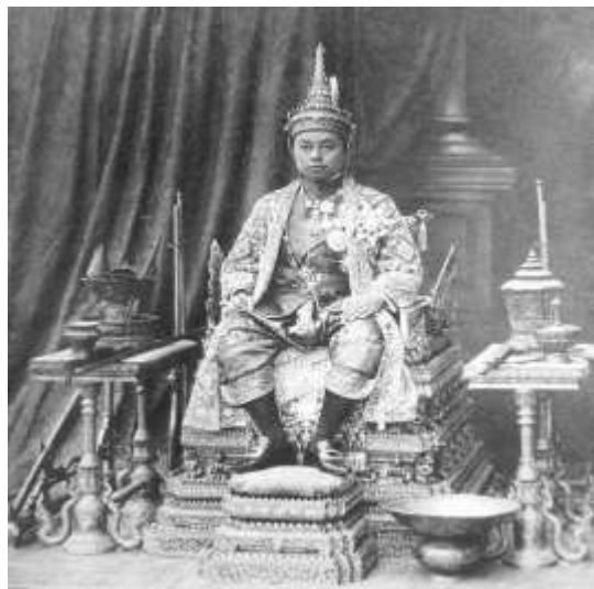
Fig. 8. King Rama 6 sat in the coronation ceremony around with his crown jewels.