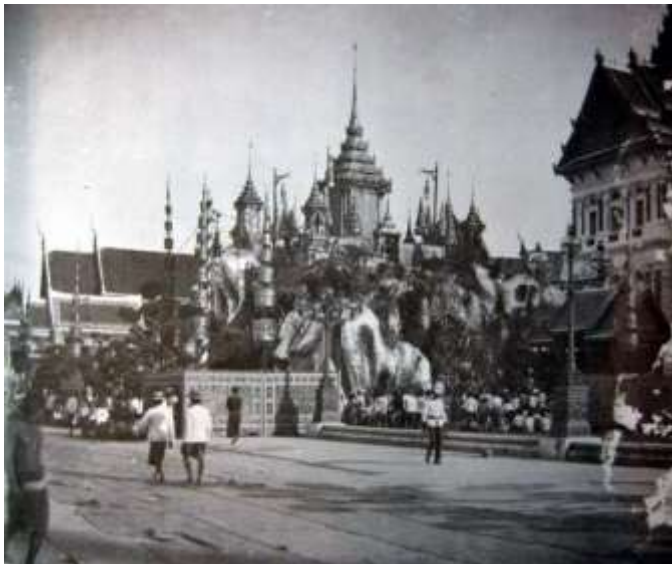
Fig 4. Decoration of mountain and city in the top knot-cutting ceremony in the reign of King Rama 5